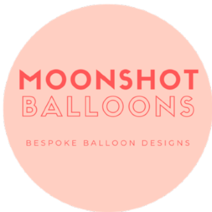
Moonshot Balloons @moonshotballoons