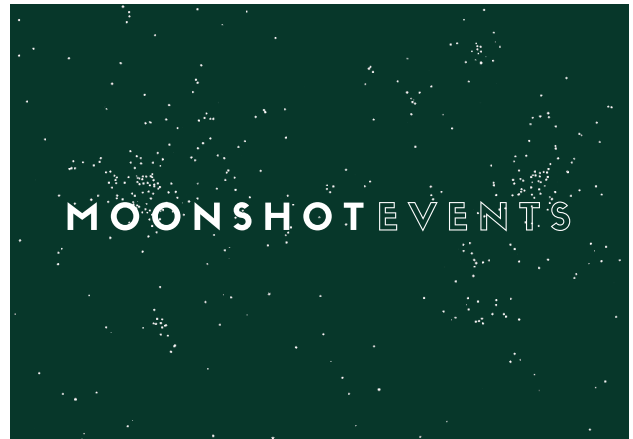
Moonshot Events @moonshot_events