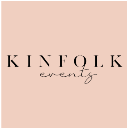
Kinfolk Events Planners @kinfolk_events

Below is a list of some of our preferred providers. We have partnered with businesses who provide amazing service and who can help make your event as special and hassle free for you as possible. Check them out on Facebook and instagram. We are happy however, to work with anyone you choose and are happy for you to source your own suppliers